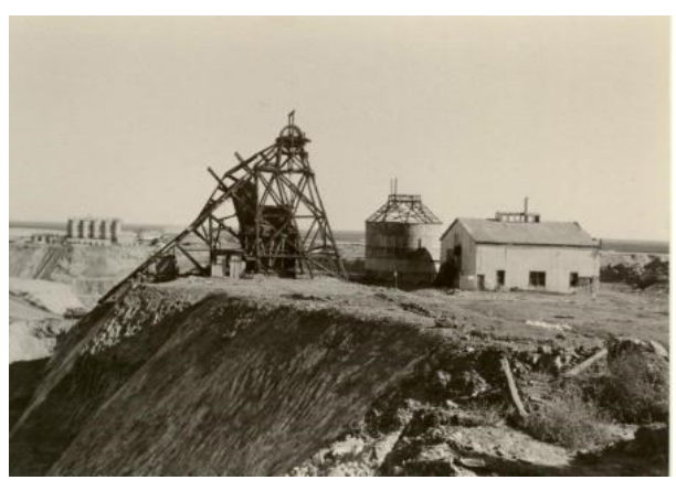
The Headframe c1987 prior to its relocation the current location.

The Shire of Leonora is busy for the preparations of conservation work to the Sons of Gwalia