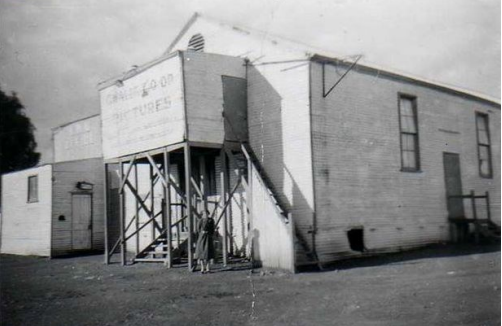
The AWU hall used as temporary school 1906. Photo taken in 1959

happened and a suitable teacher's house was built next door by 1912. This school grew in numbers so that in 1916 the little corrugated iron school from Niagara was transported to the Gwalia campus. Both the teacher's