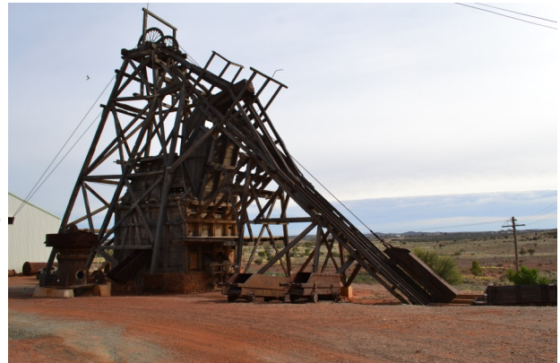
The Headframe in its current location is a well-known Gwalia landmark

Since then the harsh environment has taken its toll and the headframe's timber structure is becoming unstable. Many a photo was taken standing in the shadow of the headframe or with the headframe as