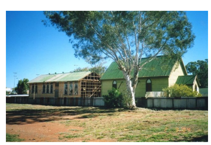
The relocated Central School behind the Christian Fellowship Church in Gwalia Street c2004 before it was demolished

By 27<sup>th</sup> July 1906 the new school was opened - at last a suitable building. Of course many changes and additions