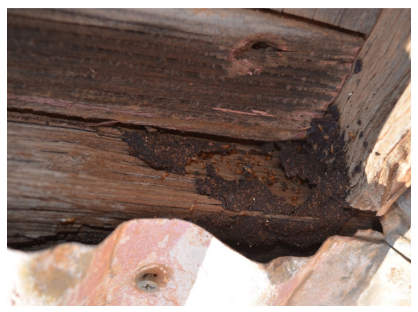
Active termites in a window frame at Major's Boarding House