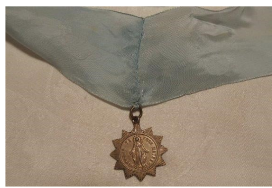
At Sunday Mass older Girls wore a Children of Mary Solidarity medal on a blue ribbon, a blue cloak over a white dress, and a net veil on their hair.

Parents bought everything. I don't remember there being a P&C and no Government funds were