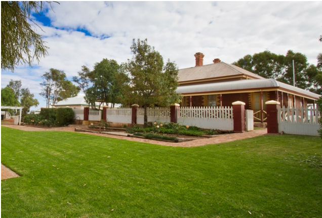
Hoover House with its lush green lawn.

Hoover House B&B is becoming more and more popular. Numbers have increased with, July being an all-time record of ninety guests for the month.