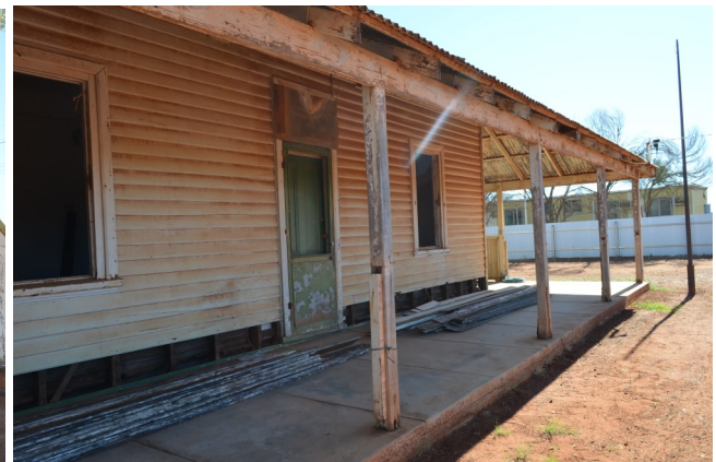
Material sourced and work started on the front verandah facing east.