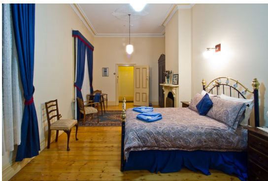
The Blue Room is the most popular to stay in.

With three rooms (two en-suite) you can bring some friends along and make a weekend of it. There is a BBQ and the dishes are even done for you.