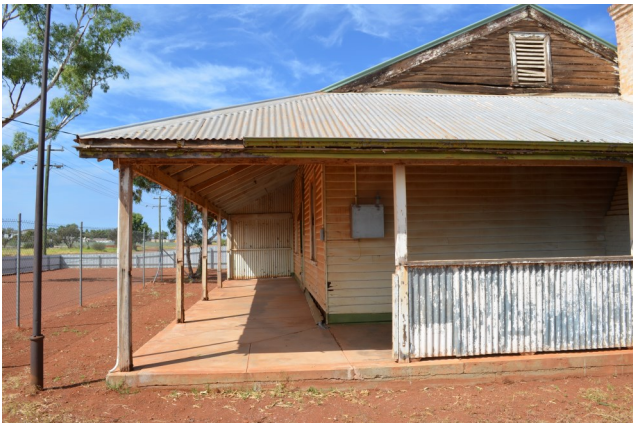
The Station Master's House shortly after work started. The yard has been cleaned up.