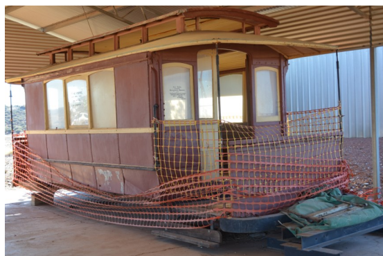
The Leonora Tram before work started.