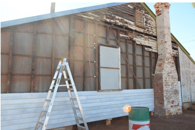
The south wall was the most deteriorated needed to be repaired and reclad.