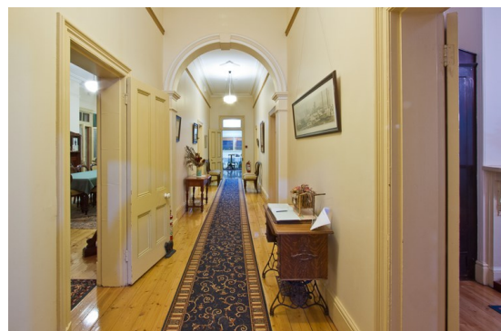
The impressive passage in Hoover House.

So come enjoy the ambience and tranquillity of our oasis in the desert.