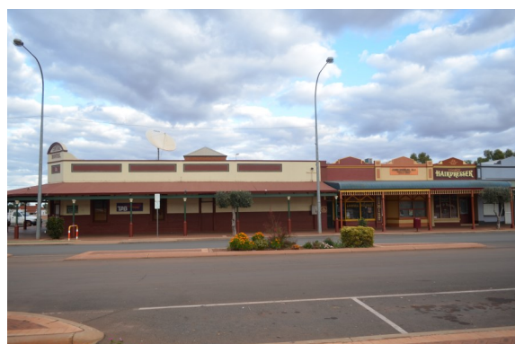
Some of the historic buildings along Tower Street.

Improving the visitor experience by offering more heritage products will keep the visitors longer in town and contribute to the sustainability of the town and community through the provision of accommodation, fuel and food services. The Trail will also navigate visitors to local shops and invite them to enter with a potential economic spin-off to the occupiers of the premises.