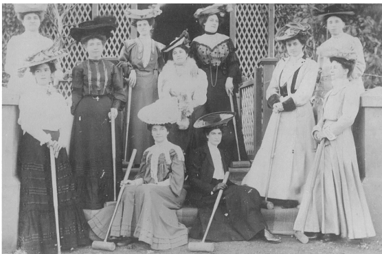
Ladies paying croquet on the lawn of the Sons of Gwalia Mine Manger's House was very popular. This photo was taken in c1901.

Public Programs to engage the local community and visitors are becoming popular. On 21 September a Victorian Afternoon Tea will be held in the garden at Hoover House.