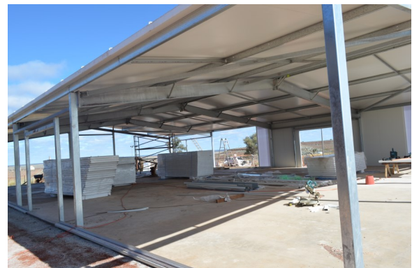
Work in progress.