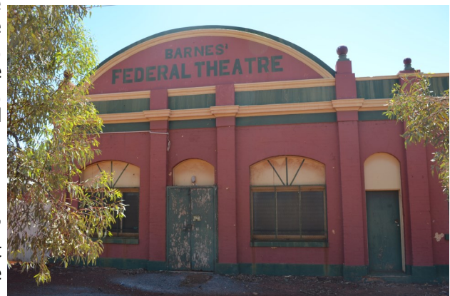
Barnes' Federal Theatre in Tower Street.

The Leonora Hotel was demolished in 1927 and the Leonora Road Board purchased Barnes' Federal Theatre for use as a community hall. It was entered in the Western Australia's State Register of Heritage Places In 2006.