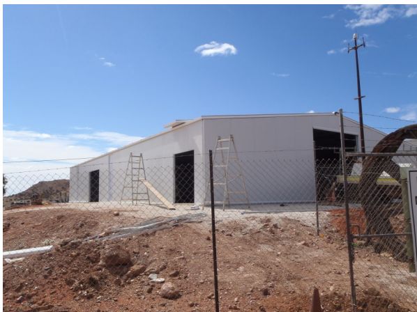
The south-west corner of the new shed at Gwalia Museum.

The roller doors, window and entry door is still to be installed. Work on the interior of the building will also start shortly. When completed the shed will house the Leonora Tram, International Mail Truck and the Hearse.